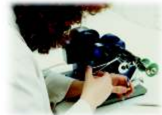
Pellistor Sensor Production

Ex d IIC T6 Gb T6 = -20 C to +40 C Ex tb IIIC T6 Db IP66 Ex d IIC T5 Gb Ta = -20 C to +55 C Ex tb IIIC T5 Db IP66