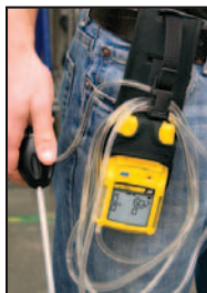
Carrying Holster GA-HXT Sampling Probe GA-PROB1-1