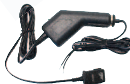
Direct-Wire Power Adaptor 12-24 Vdc GA-PA-3 Used for emergency vehicles and other applications