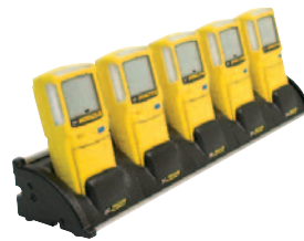
Multi-Unit Cradle Charger XT-C01-MC5 Simultaneously charge 5 detectors