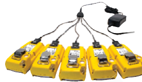
Multi-Unit Power Adaptor GA-PA-1-MC5 Simultaneously charge 5 detectors