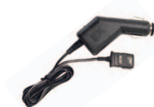
Vehicle Power Adaptor 12-24 Vdc GA-VPA-1