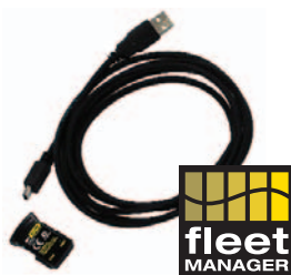
IR Connectivity Kit GA-USB1-IR Use for data download and instrument set-up options