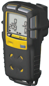
Concussion-Proof Boot GA-BXT